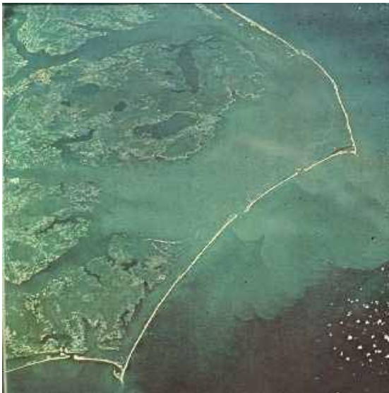
Aerial photo of Cape Lookout National Seashore

Four species of sea turtle visit the Seashore, including the endangered loggerhead sea turtle which nests on the sandy beaches of the Seashore. Other endangered species that can be found on the Seashore include the piping plover shorebird and seabeach amaranth plant.