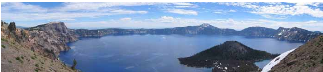
Panoramic view of Crater Lake

Number of units with eligible or potential wilderness: 1