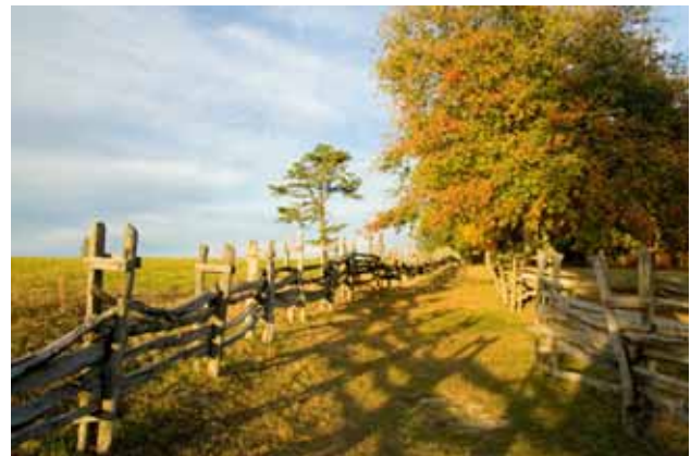
A historic homestead in Cumberland Gap National Historical Park