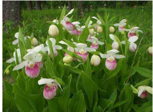
Showy ladyslippers, the Minnesota State Flower, are common in Voyageurs National Park.