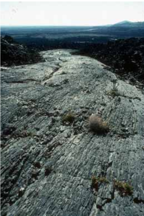
A solidified river of lava at Craters of the Moon National Monument and Preserve.

Craters of the Moon is jointly managed by NPS and the Bureau of Land Management; NPS manages 464,304 acres and the BLM is responsible for approximately 250,000 acres.