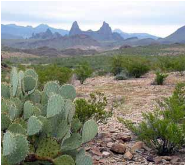
Big Bend National Park

In addition to more bats species than any other park, there are more types of birds, cacti, and tropical butterflies in Big Bend than any other national park in the United States. The park is the northernmost range of many tropical plants and animals, and the southernmost range for many northern species. In addition, ranges of typically eastern and typically western species of plants and animals come together or overlap here.