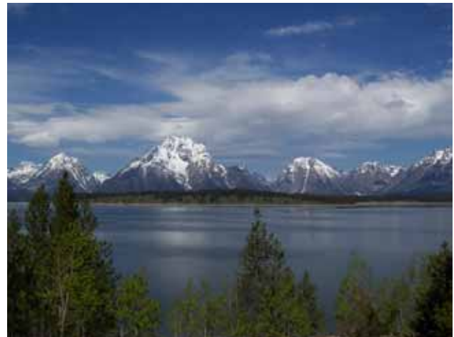
The Teton Range of Grand Teton National Park