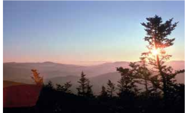
Sunset over Great Smoky Mountains National Park

Elk were native to the southern Appalachians but were extirpated in the early 1800s. In 2001, NPS began a reintroduction program in Great Smoky Mountains National Park and the herd is now up to 95 animals.