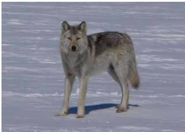
Voyageurs National Park is one of few parks in the lower 48 states where wolves can be found.

The glacial history of the park left behind more than lakes, wetlands, and rocky outcrops. It also exposed rocks over two billion years old; these rocks are older than the rocks exposed at the bottom of the Grand Canyon.