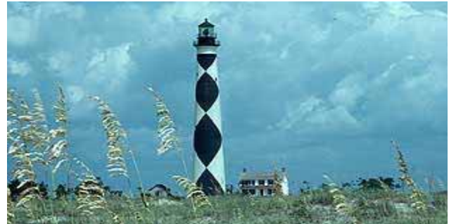
The Cape Lookout Lighthouse at Cape Lookout National Seashore