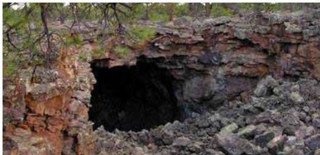
One of the many lava tubes found in El Malpais National Monument.