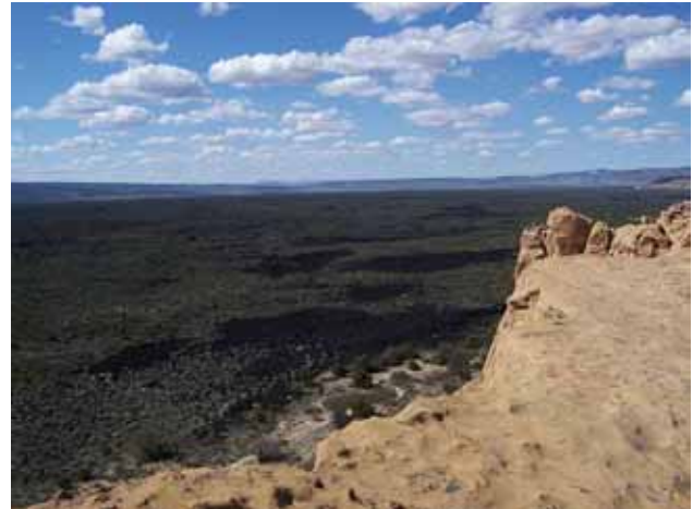
El Malpais National Monument.