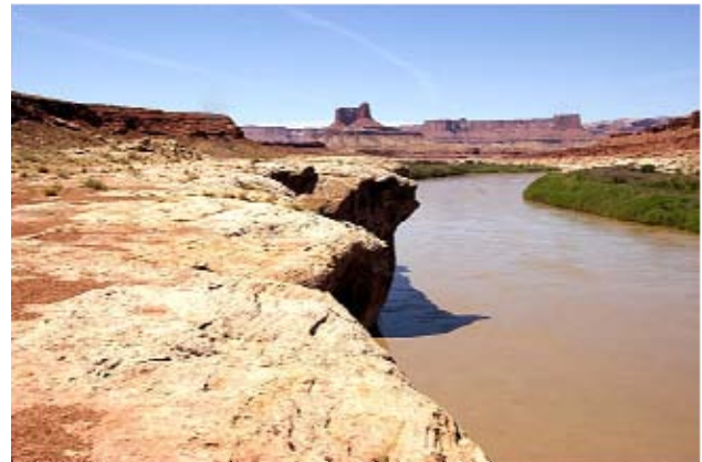
Canyonlands National Park