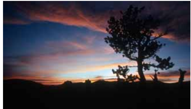
Craters of the Moon National Monument and Preserve

In 1970, Congress designated 43,243 acres of the National Monument as the Craters of the Moon Wilderness, the first Wilderness area in the National Park Service.