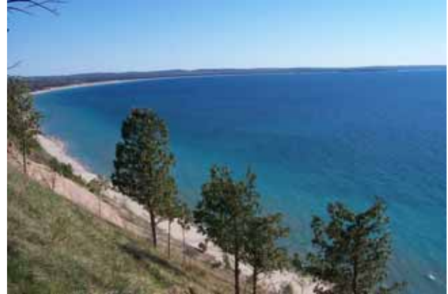
Sleeping Bear Dunes National Seashore.

plovers. In 20 years of active management, the number of breeding pairs has increased from 17 in 1986 to 59 in 2005.