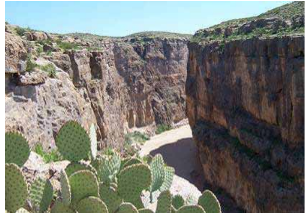
One of many river canyons in Big Bend National Park