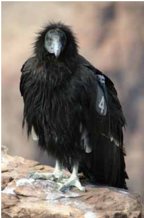
Grand Canyon National Park is one of few places in the world where there are free-flying California condors.

Grand Canyon is the 2 nd most visited National Park, with over 4.4 million visitors in 2007. Most of these visitors would be surprised to find out that in this majestic park, there are no designated wilderness areas. Grand Canyon is primarily known for its spectacular mile deep gorge, cut by the Colorado River. In addition to this geologic wonder, it has nearly every habitat found in the Southwestern United States, including montane forest and Mojave desert. These habitats are home to a large diversity of plants and animals, including the California condor and seven threatened and endangered species.