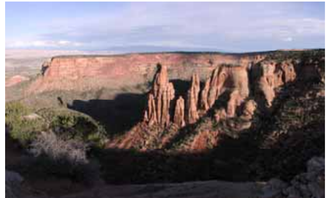
Colorado National Monument

Dinosaur National Monument's headquarters are in Colorado but the monument itself is in both Utah and Colorado.