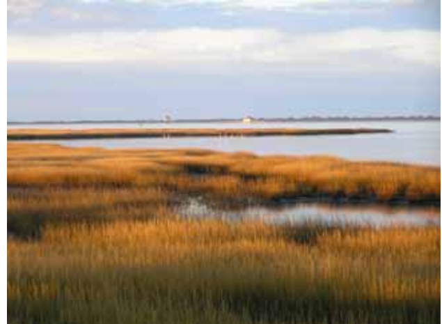
Salt Marsh at Assateague Island National Seashore.

Assateague Island National Seashore is home to wild horses descended from the domesticated horses of early settlers. It is one of few places in the United States where visitors can observe wild horses.