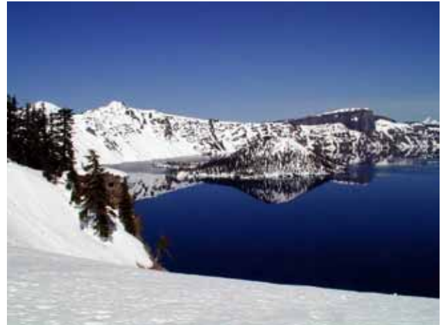
Wizard Island in Crater Lake National Park