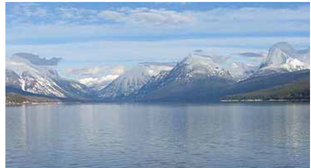
Lake McDonald in Glacier National Park

Bighorn Canyon National Recreation Area wetlands. It is home to its namesake, bighorn sheep, and to wild horses.